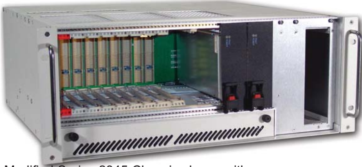
Modified Series 2345 Chassis shown with dual power supplies and optional FDD & HDD drive bracket