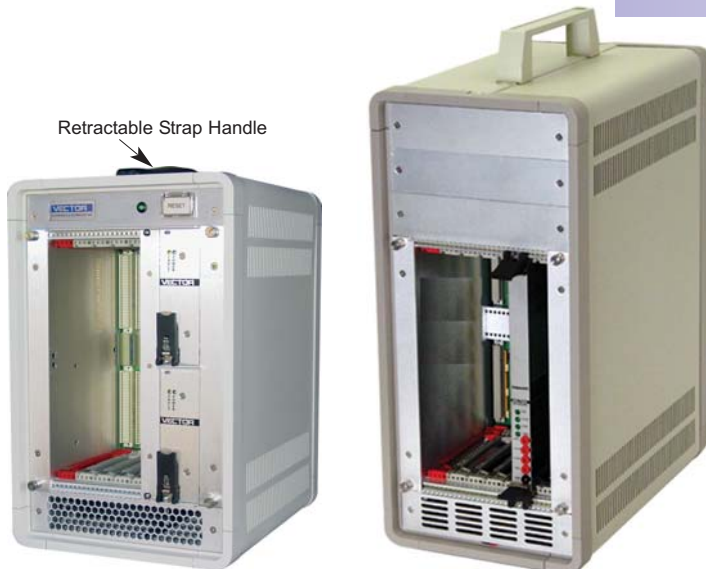
Retractable Strap Handle

Integrated internal subrack assembly removes completely from outer enclosure and secured with thumbscrews - no tools required. Will support VME, VME64x, cPCI 6U backplanes up to 12 slots. Many power supply options. Can be configured with peripheral bays all accessible from upper front panels. Internal drive brackets available.