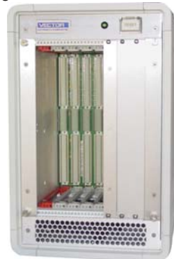
Series 815 with ATX Power Supply